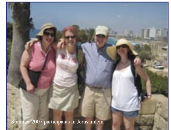
Summer 2007 participants in Jerusalem