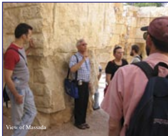
View of Massada