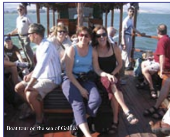
Boat tour on the sea of Galilea