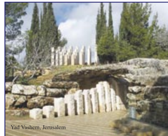
Yad Vashem, Jerusalem